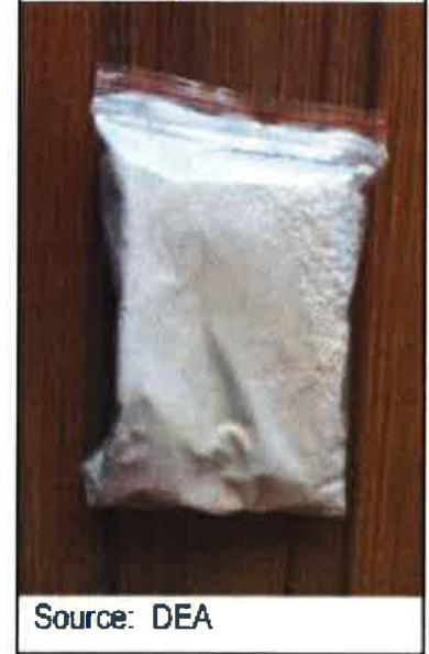
(U//DSEN) Figure 1. Exhibit consisting of carfentanil.

(U//DSEN) DEA reporting indicates that chemical manufacturers in China may be using both the regular internet and underground internet sites to send carfentanil to U.S. distributors that repackage the drug for sale to the retail market. This poses a grave risk to the U.S. market— especially as federal, state, and local law enforcement agencies grapple with the current nationwide heroin and fentanyl epidemics and struggle to curb overdose deaths and injuries attributed to synthetic opiate analogs. iv