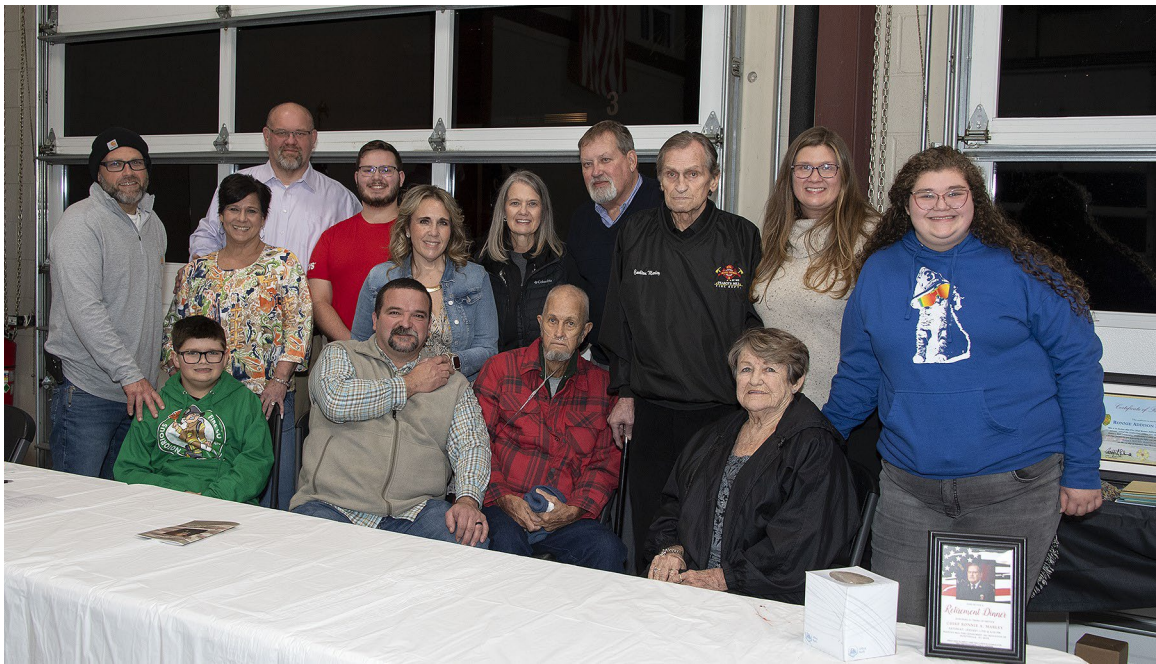
Family and Friends