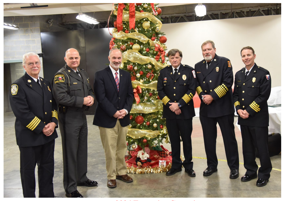
2024 Executive Committee